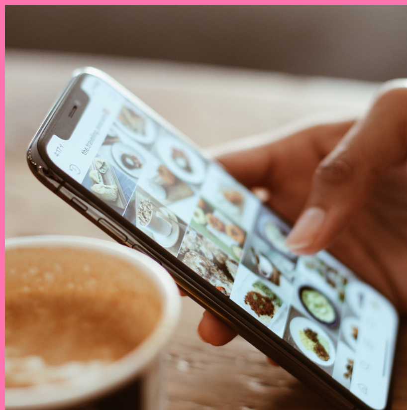
SOCIAL MEDIA MANAGER